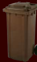
240-litre brown bin for apartment blocks