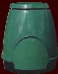
300-litre composter for rural areas

Use the compostable bags, close them tightly and put them in the 25-litre brown bin in urban areas, in the brown bin in apartment blocks or in the 300-litre composters in rural areas.